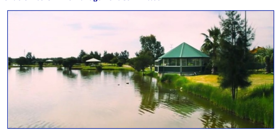
Beautiful surrounds at Golden Ponds

Our 24th AGM Rally was held at Golden Ponds in Baldivis with fourteen vans attending and a total of 35 full and two associate members registered for the AGM. The weather was kind and allowed us to wander around the spacious grounds of the caravan park, the surrounding gardens and manmade ponds. The evenings were chilly but we had the use of the communal kitchen and dining room, which enabled us to meet for dinner and games.